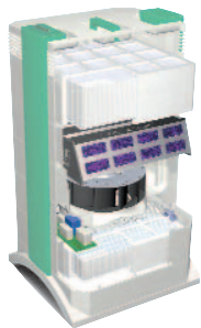
IQAir® Cleanroom 250

The IQAir® Cleanroom Series consists of three high-performance air cleaning models ( Cleanroom 100, 250 and H13 ). Each model is specifically designed for the removal of solid and liquid airborne particles and aerosols. Due to their certified and guaranteed high filtration efficiency, the systems are predominantly used for airborne infection control in health-care settings and for the control of particulate matter in cleanroom-type applications.